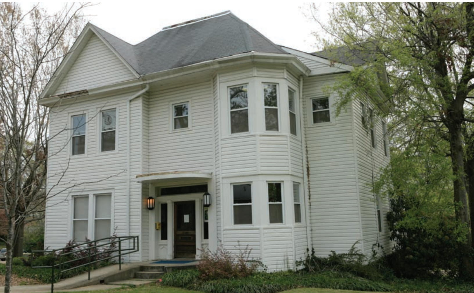
Once serving as the president's residence, John Stone Hall is the home of the Writing Center, the Core Curriculum office, and the classical studies department.