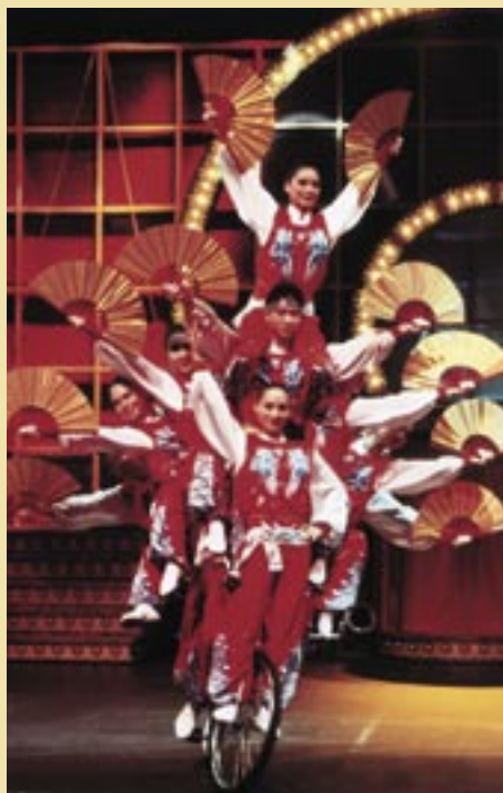
The award-winning Chinese Golden Dragon Acrobats.