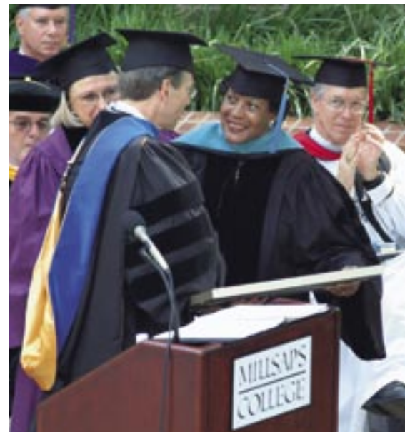
Myrlie Evers-Williams receiving her honorary degree.